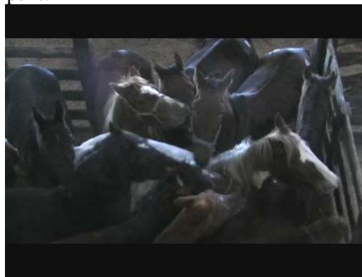
Panicked horses on top of trampled horse