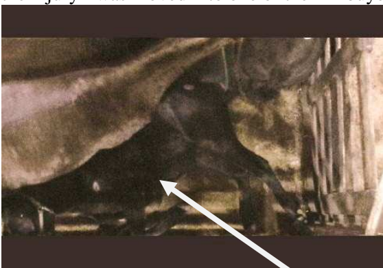
Horse being trampled by others

He used a wooden stick excessively beating the horses on the head and the hip bones. The animals were very outraged and rushed through the pens. This led to one horse going down and being trampled by others. Luckily she managed to get up again. At this point, she was severely limping and – without anybody paying attention to the injury - was moved into one of the kill buyer's pens.